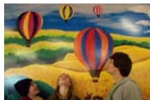
Lipstick Homicide + the Fake Boys + Muddy Rails + The ILLS May 23, 10:00PM @Gabes