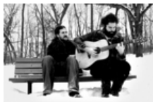
Daniel and the Lion May 23, 8:00PM @The Englert Theatre