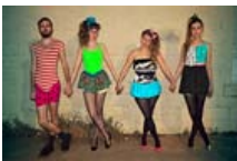
Ramona & The Swimsuits + Pennyhawk + Neon and Nude May 24, 9:00PM @The Mill